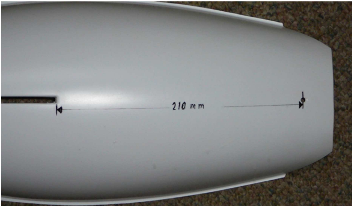
Figure 1: rudder position